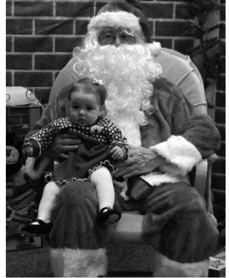
Santa stops here! Our littlest loved visits with a superstar on Dec. 10.

For more information on Beginnings Ministry, contact 614-885-