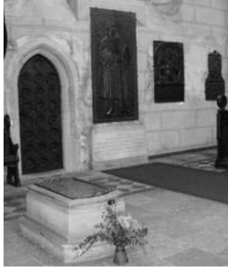
Martin Luther's tomb at the Castle Church in Lutherstadt-Wittenberg.

The Castle Church is often referred to as the "birthplace of the Reformation." It is after all, according to tradition, where Martin Luther posted his 95 Theses on October 31, 1517, on the eve of the Feast of All Saints. Some writers have even stated that the sanctuary is more than the birthplace, but that it is the Reformation Memo-