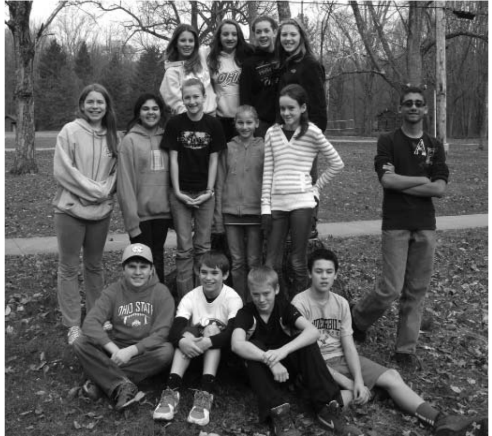
Our 7th-graders learned and bonded during the annual retreat.